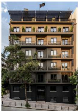
Above and left The rooftop garden and exterior of the Athens hotel; and one of its minimalist rooms.