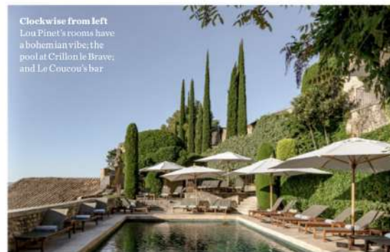
Clockwise from left Lou Pinet's rooms have a bohemian vibe; the pool at Crillon le Brave; and Le Coucou's bar.